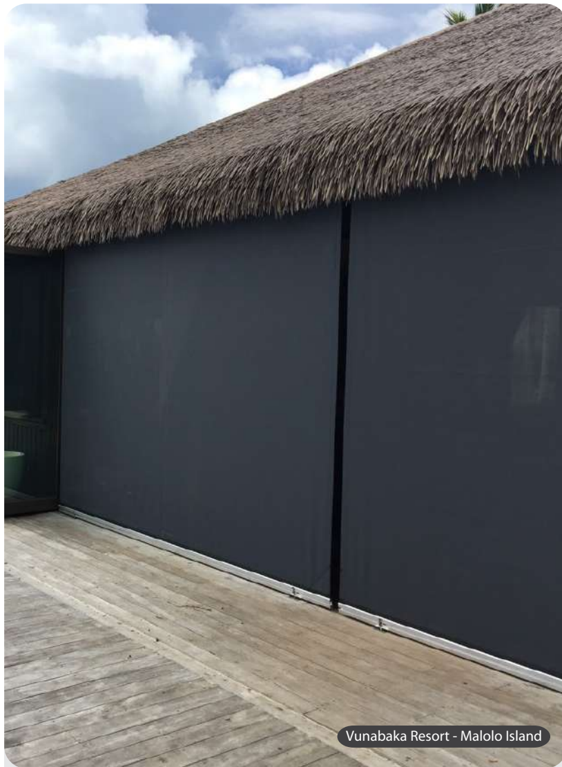
Vunabaka Resort - Malolo Island

Outdoor blinds provide shade and privacy , which means the interior of your home will stay cooler during the hot weather months.