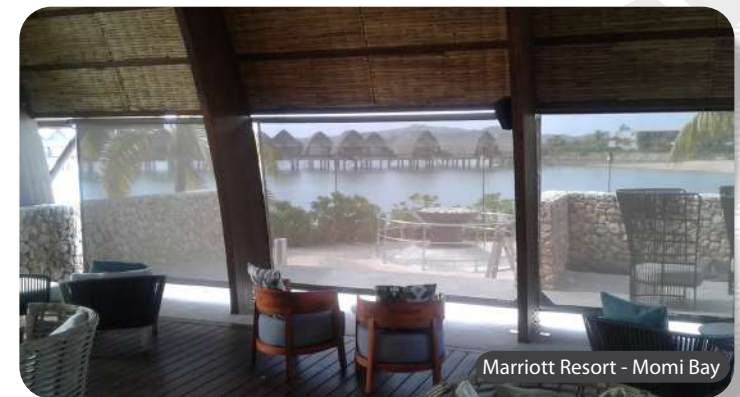
Marriott Resort - Momi Bay